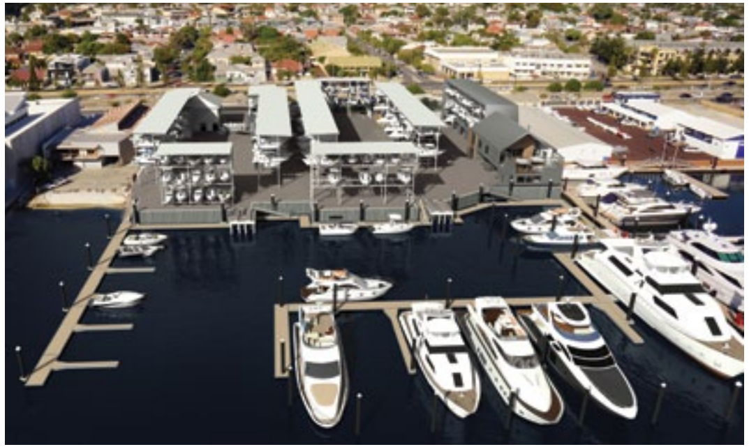
Computer image of the completed Boat Park and Marina facility at 7-10 Mews Road

In 2013 the newly formed Blue HQ purchased the former Fremantle Boat Park boat stacking business and adjoining land at 10 Mews Road. With a focus on acquiring premium waterfront sites to provide modern boat stacking and private marina services, Blue HQ has embarked on a major renovation of the Boat Park including the construction of an adjacent private marina facility and totally new floating jetties across the combined sites.