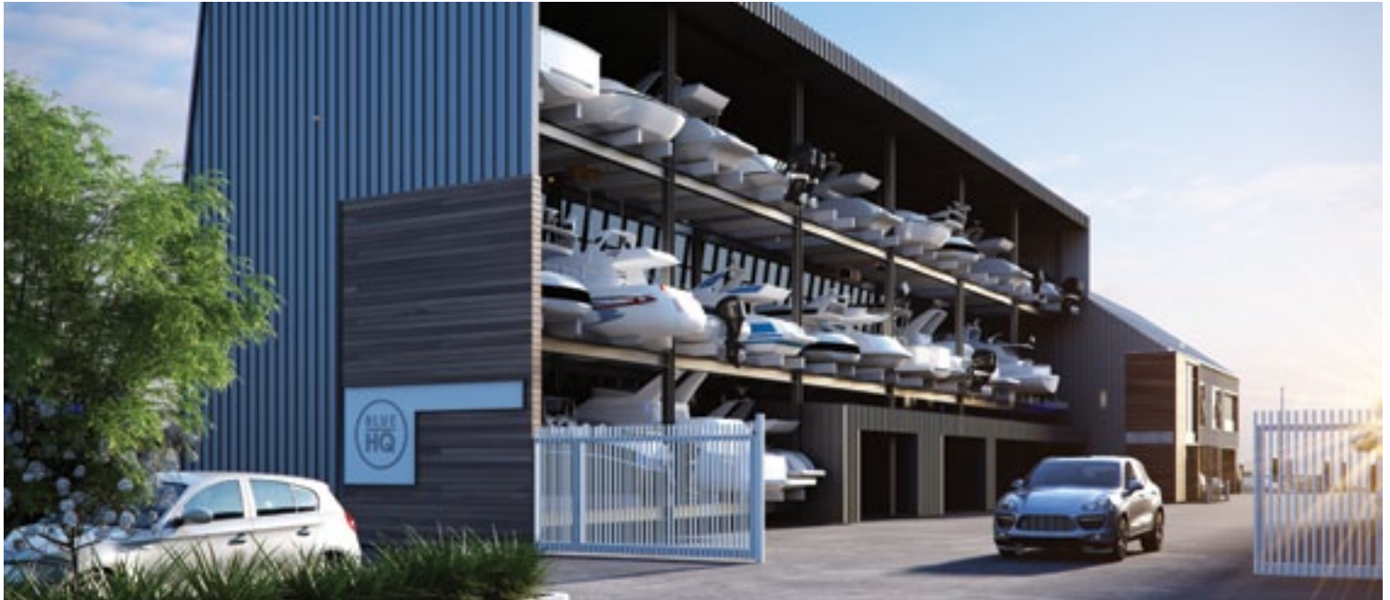
New private marina building and undercover stacks