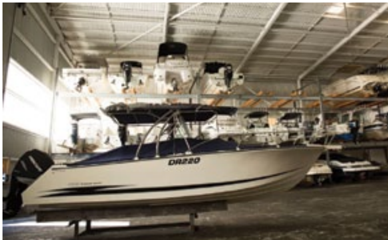
Indoor boat stacking at Boat Lifters

The site will be rebranded as Blue HQ Fremantle - Boat Lifters .