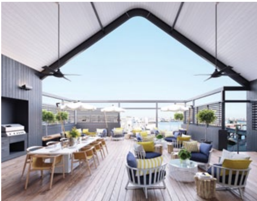
Customer deck in new private marina building